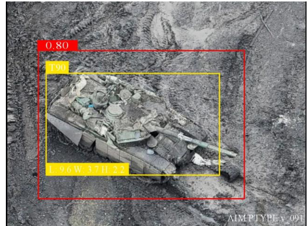
Figure 2. Example of the systems Target Classification

In this section, we present the experimental results of our methodology for determining target GPS coordinates using a UAV's position and ground range calculations. The primary aim of this experiment is to validate the accuracy and effectiveness of our approach, leveraging computer vision, image processing, and precise mathematical computations. We provide detailed quantitative data and visual representations to illustrate the performance and reliability of the system.