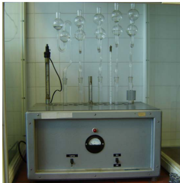
Figure 1. Apparatus for Bergman-Jung method

Before starting the experiment, heating tubes and absorption nozzle should be connected. The solvent for absorption of the nitrogen oxide from gunpowder is 3% of hydrogen peroxide. Also, a small sample of solid MnO 2 is added into a solvent. The solvent should be carefully transferred from the absorption nozzle into the heating tube where the examined samples are placed. That apparatus was placed into a thermo block and heated at 132°C for 5 hours, Fig.1.