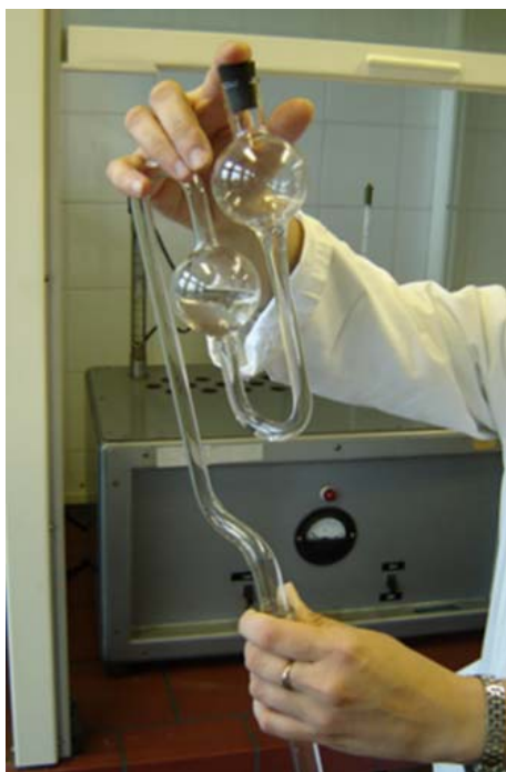
Figure 2. Replacing the solvents into the heating tube after heated at 132 °C for 5 hours

The samples with solvents were prepared according to classical analytical filtration method. Resulting solution filtrate provides the determination of nitrogen oxide by using one of subgroups of the Bergman-Jung method.